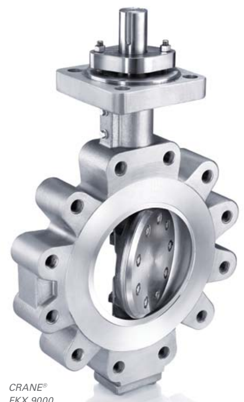
CRANE® FXK 9000