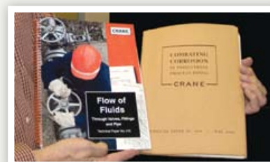
Crane TP-410 Current & the original 1942 books

XOMOX® offer customers complete and innovative product portfolio designed for the most demanding corrosive, erosive, and high purity applications. Among the industries served are the chemical processing, biotechnology, pharmaceutical, oil & gas, refining, and power generation.