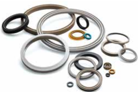
Polymer spring energized seals