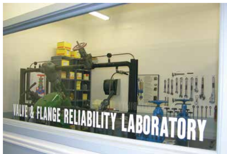
Testing and installation training are critical components for reliability

"Our ability to custom blend and manufacture specific materials gives us the capability to handle some of our most difficult challenges. We take higher end manufactured polymers and load them to create a seal. For instance, we are producing five different blends of PEEK polymer material and are able to control the quality – which is critical because these tough applications demand flawless material," said Thomas Richard. "When no one else can tackle the challenge, people