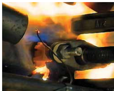
Low emission packing passes fire testing

The level of knowledge, engineering, and testing combined in the development of Chesterton's packing and sealing products is an important component of the company's product solutions. Chesterton segments the valve sealing industry into three areas of focus: End Users, OEMs, and Service Providers such as contractors and valve repair shops. With each segment, Chesterton is able to provide tailored, engineered solutions for the valve sealing needs of a variety of industries such as offshore, refining, exploration, mining, chemical, nuclear, and fossil power. While each segment has its own set of specific requirements, all clients are looking to Chesterton for