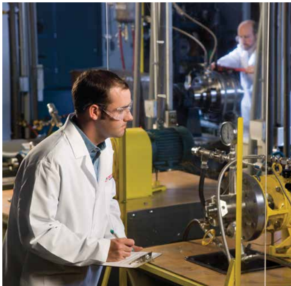
Recent on-site testing investment has greatly expanded capabilities