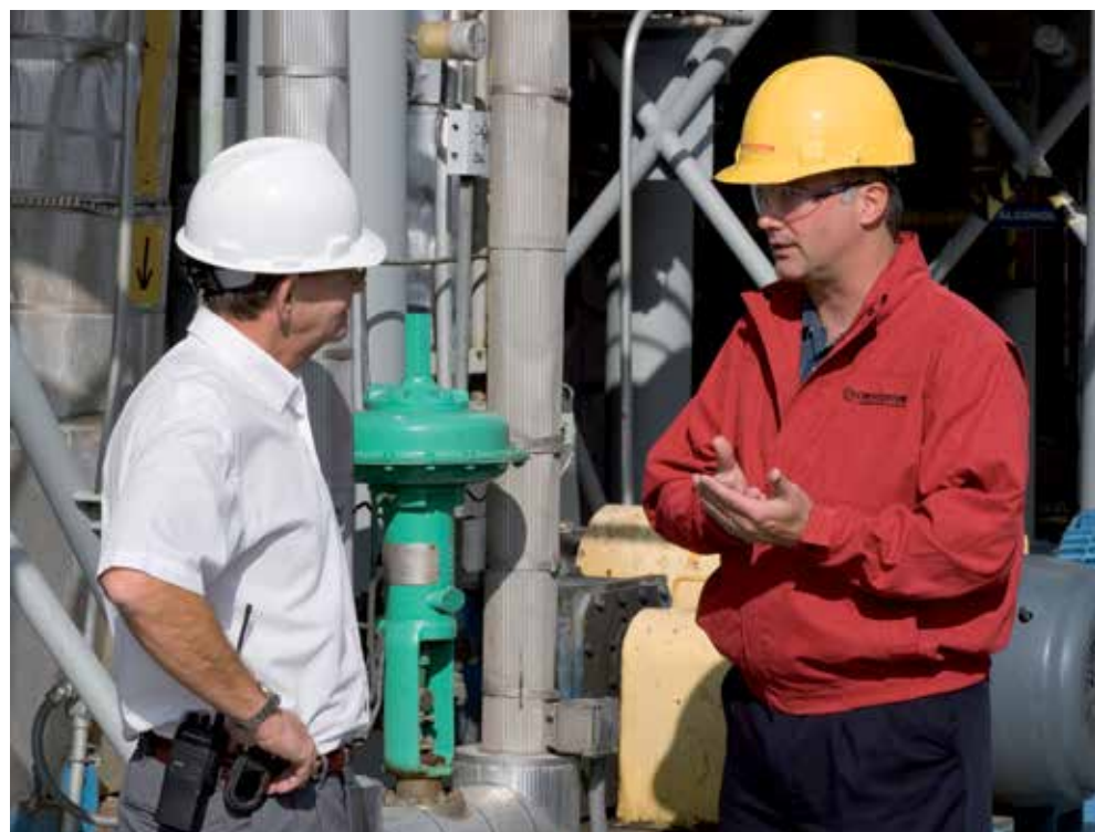
Providing valuable knowledge is a key focus